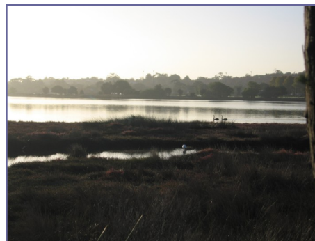
Twilight at Alfred Cove

Promotion of the Estuary's environmental values through public-education strategies will also be an important function.