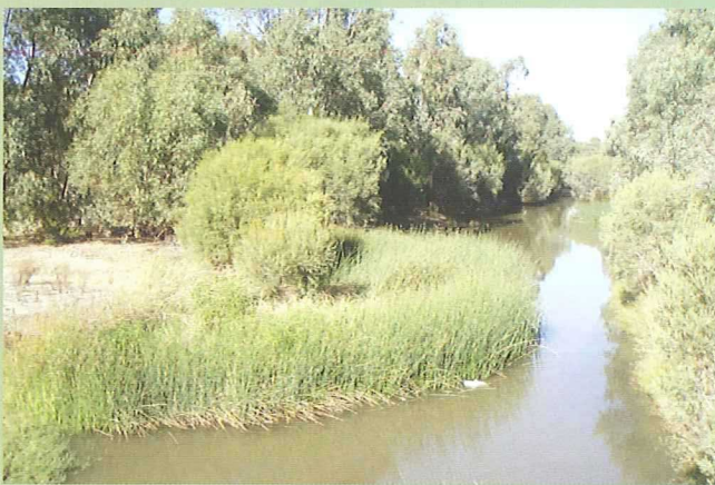
2009: McNeill Road Bridge site

Throughout the past 10 years AGLG and the Palomino Reserve Catchment Group (PRCG) have worked together to rehabilitate the Palomino Reserve. The Reserve is located along the Wungong River which was designated public open space and vested within the City of Armadale in 1981. In 1999 the AGLG and PRCG took on the task to restore the foreshore and to date have successfully rehabilitated over 7 hectares.