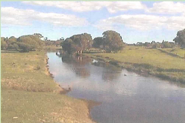
1999: McNeill Road Bridge site before AGLG and the Palomino Reserve Catchment Group commenced rehabilitation works

Throughout the past 10 years AGLG and the Palomino Reserve Catchment Group (PRCG) have worked together to rehabilitate the Palomino Reserve. The Reserve is located along the Wungong River which was designated public open space and vested within the City of Armadale in 1981. In 1999 the AGLG and PRCG took on the task to restore the foreshore and to date have successfully rehabilitated over 7 hectares.