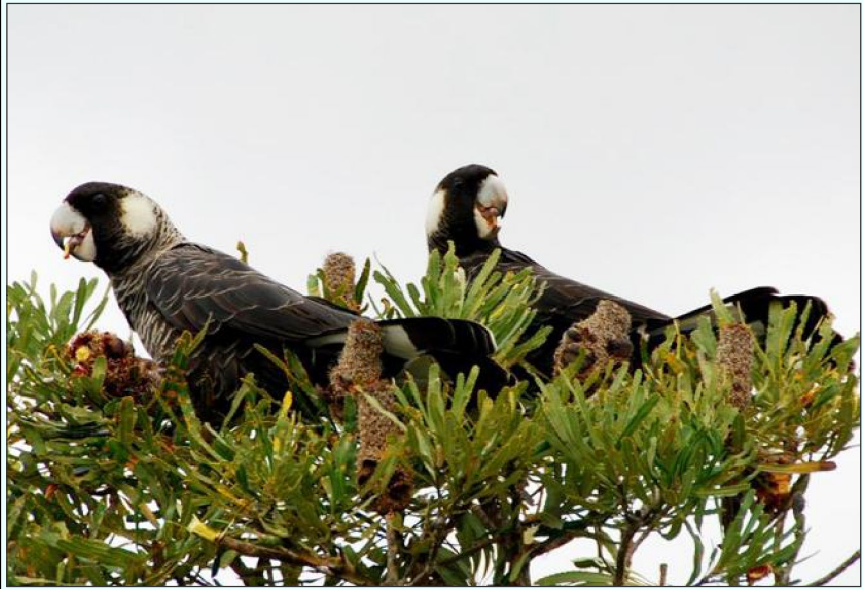
Carnaby's cockatoo feeding on Banksia (L. Valentine)