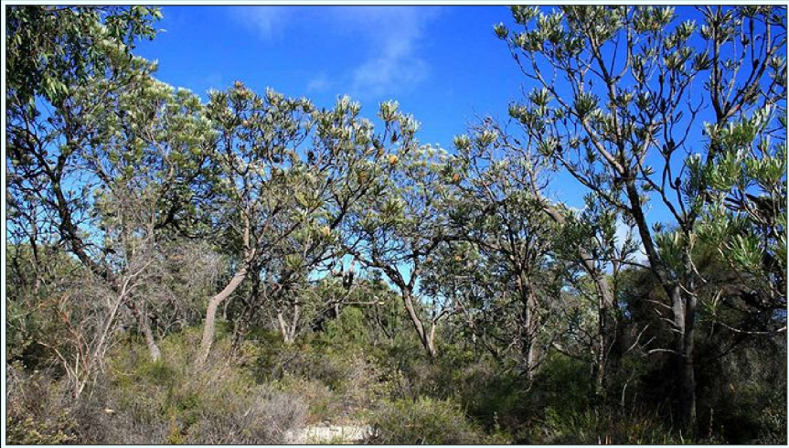
Banksia Woodlands