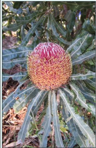
Banksia menziesii (Dept. of the Environment and Energy)