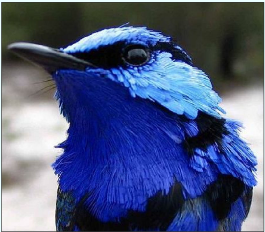
Splendid fairy wren