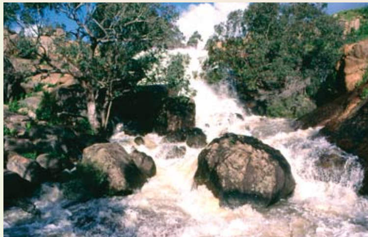
Below National park falls, John Forrest National Park.

In some sections the trail makes use of parts of the management tracks which run throughout the park, while other sections are purpose-built as walking tracks. Through the whole length of the trail you will be guided by the yellow triangle emblem with the silhouette of the eagle on it. Sometimes these are slightly less frequent when the trail coincides with another walk trail, such as along the northern side of Jane Brook. The trail is marked every two kilometres and sign posted with the letters that appear on the map overleaf. All junction and turning points have been well designated, so you shouldn't have too much trouble finding your way.