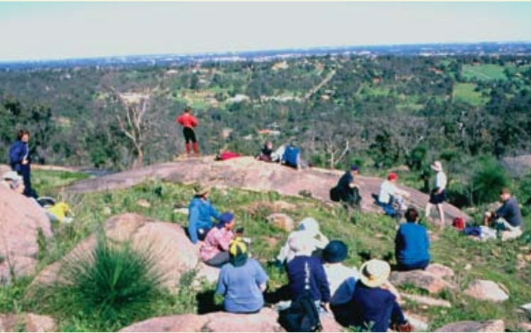
Above Bushwalkers on Eagle lookout.

The Eagle's View Walk Trail is a 15-kilometre bushwalking circuit that leads you to several of John Forrest National Park's less explored destinations. The trail is a bushwalker's delight, covering a variety of relatively pristine habitats. It's also more challenging than other trails in the park, but your efforts are well rewarded. Be sensible and allow plenty of time for the walk which, depending on your level of fitness, will take from about four and half to seven hours. This also depends on your interest in your surroundings as you go along.