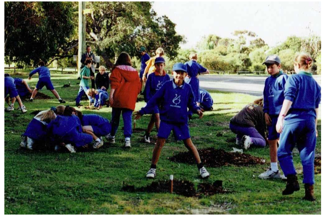
Swanbourne Primary students planting banksias

To help raise funds for the regeneration program, the Friends are selling a special T-shirt ($20 or $10 for child's size). Tel. Lesley Shaw, (08) 9384 7983.