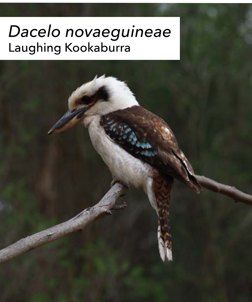
Dacelo novaeguineae Laughing Kookaburra