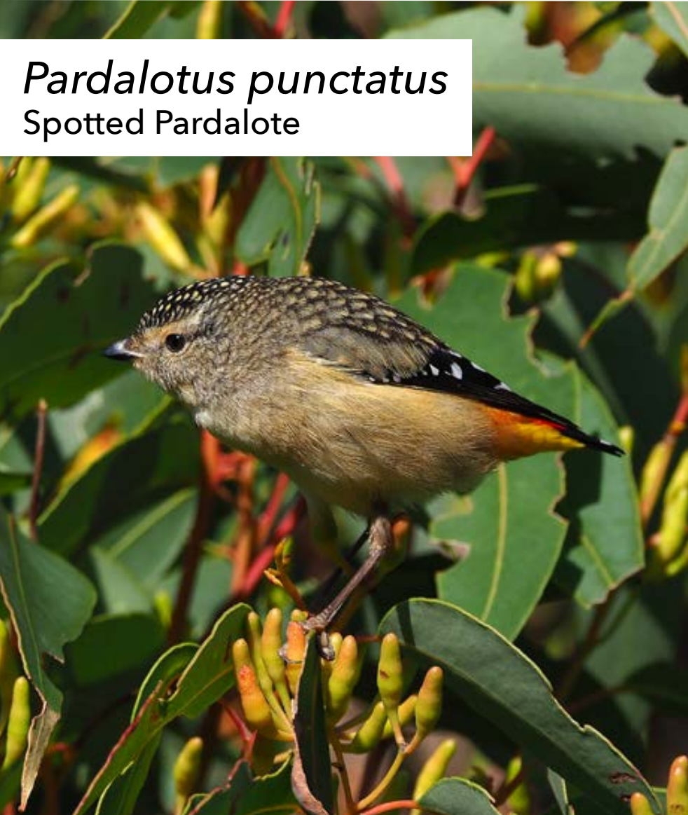
Pardalotus punctatus Spotted Pardalote