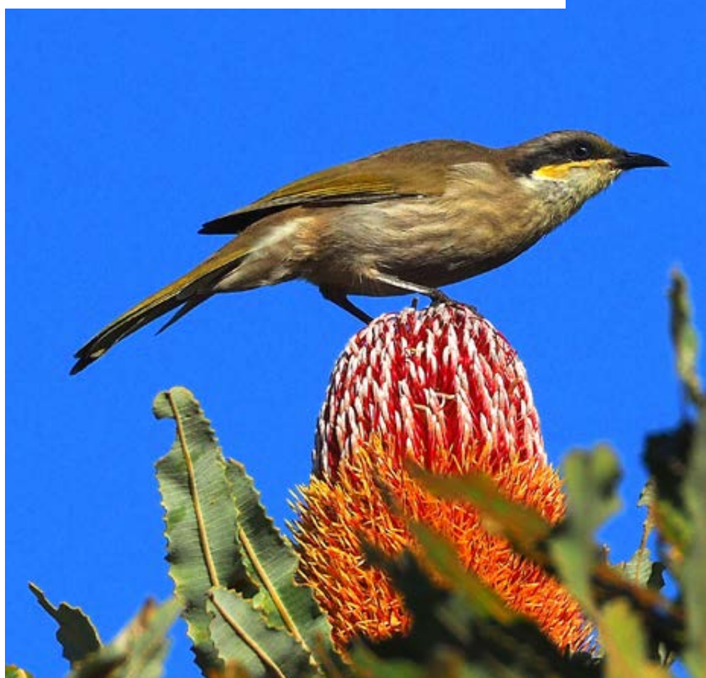
Lichenostomus virescens Singing Honeyeater