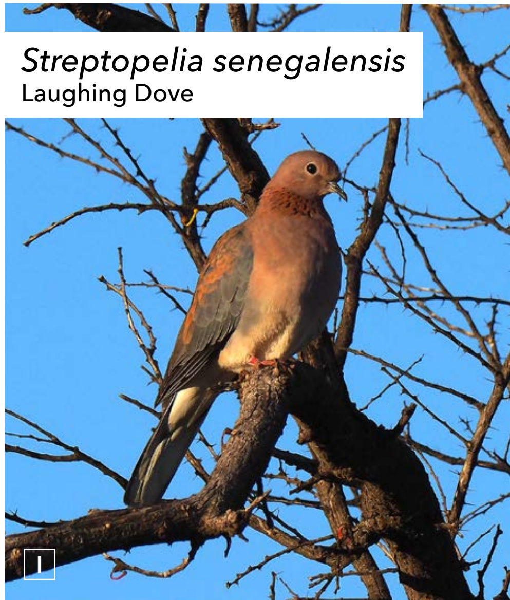
Streptopelia senegalensis Laughing Dove