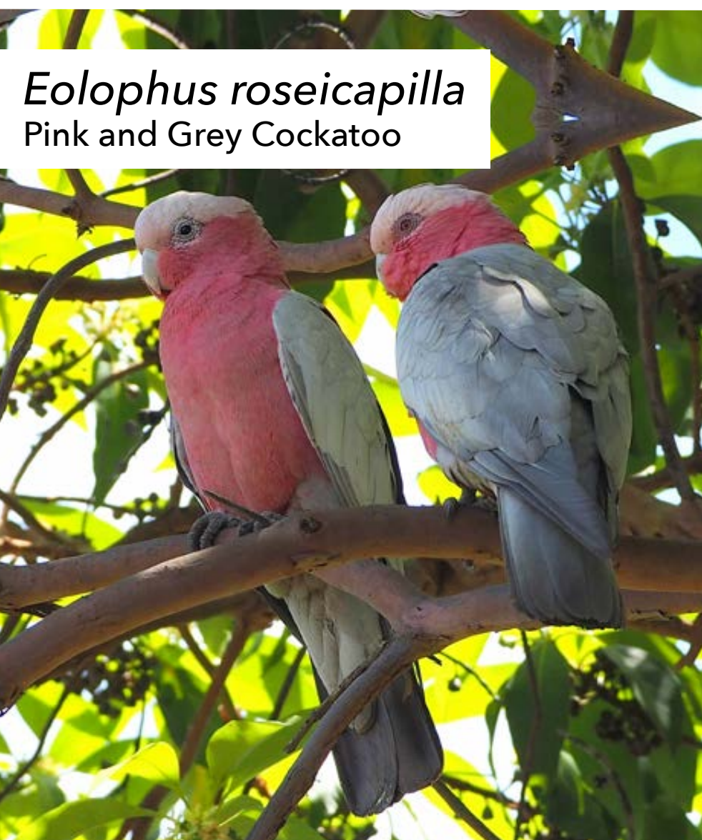
Eolophus roseicapilla Pink and Grey Cockatoo