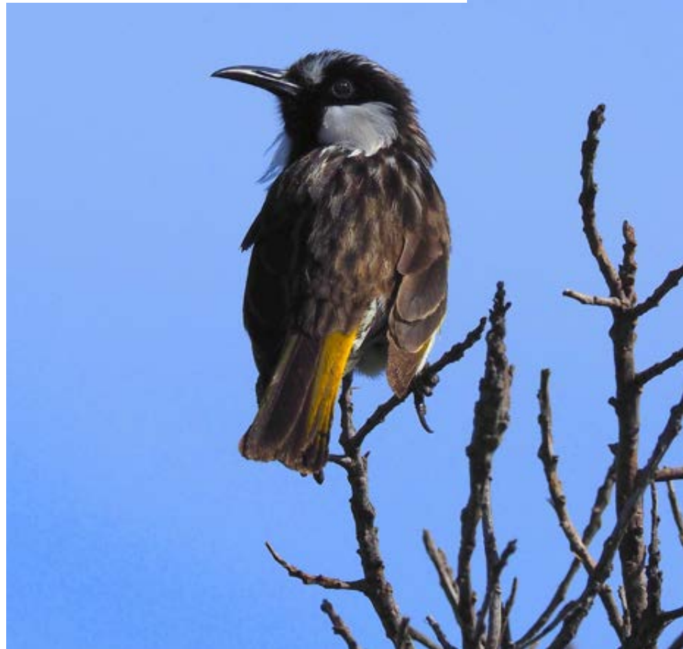
Phylidonyris niger White-cheeked Honeyeater