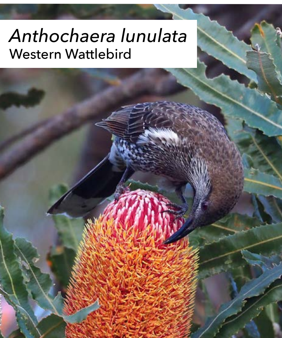
Anthochaera lunulata Western Wattlebird