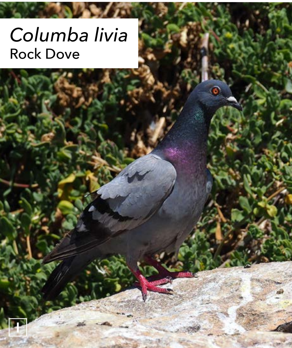
Columba livia Rock Dove