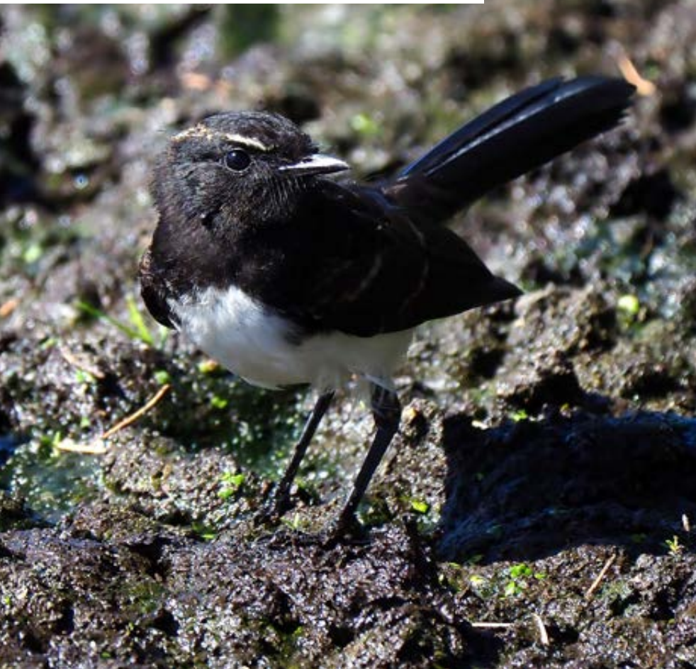
Rhipidura leucophrys Willie Wagtail