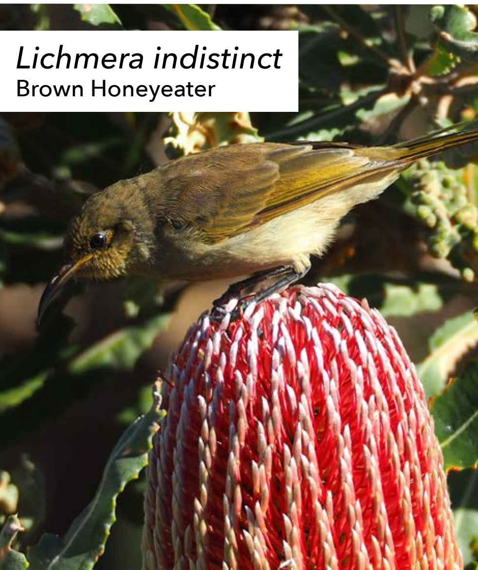
Lichmera indistinct Brown Honeyeater