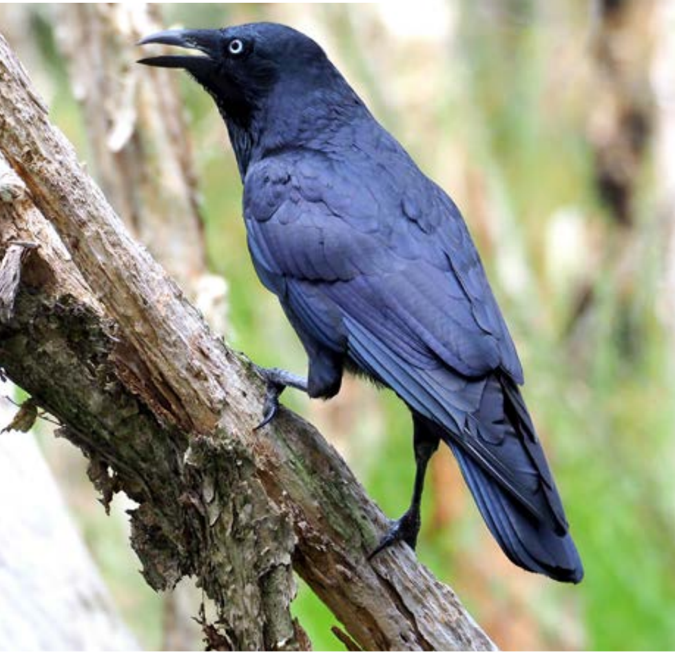
Corvus coronoides Australian Raven