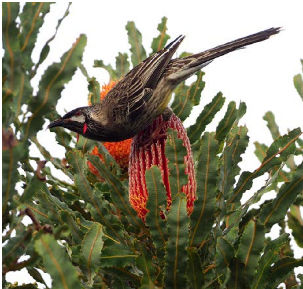
Anthochaera carunculata Red Wattlebird