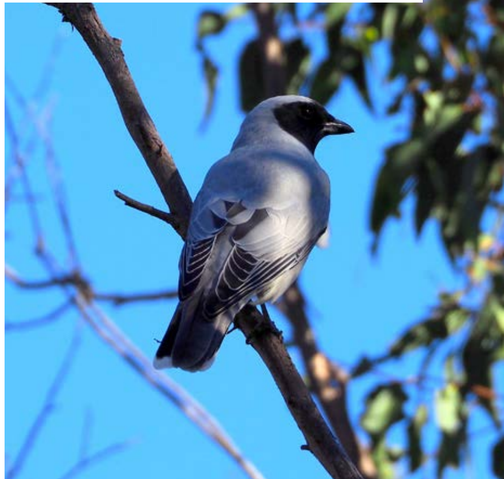
Coracina novaehollandiae Black-faced Cuckooshrike