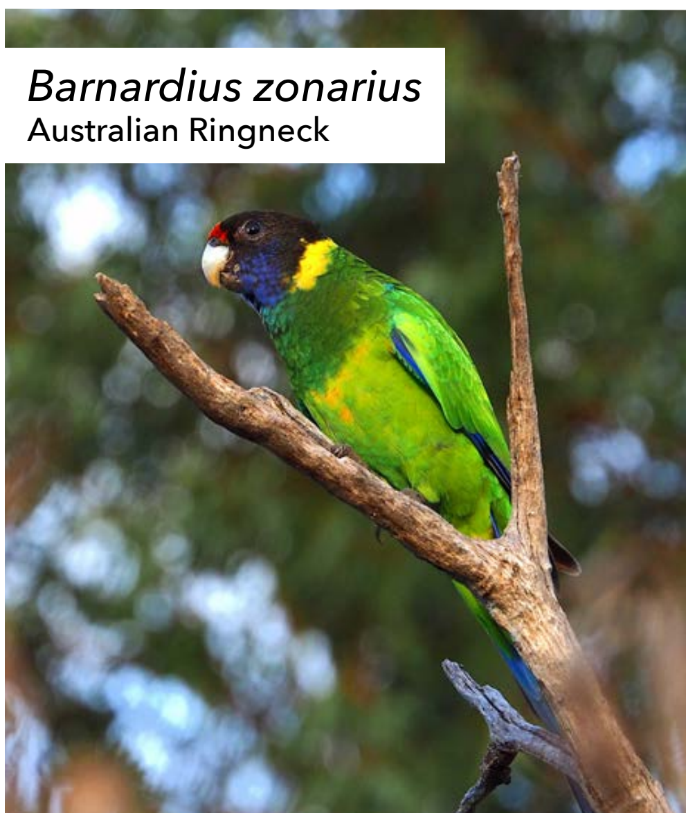
Barnardius zonarius Australian Ringneck