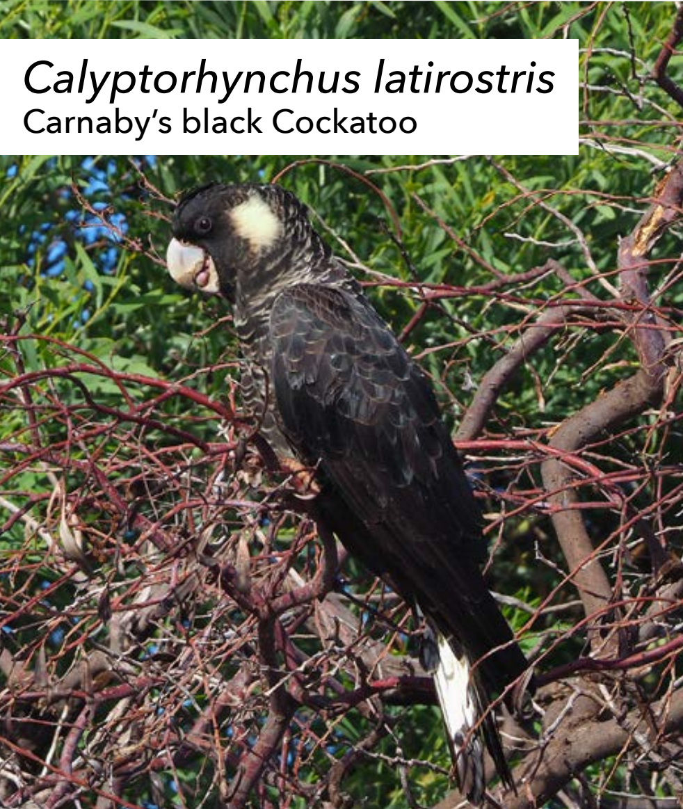
Calyptorhynchus latirostris Carnaby's black Cockatoo