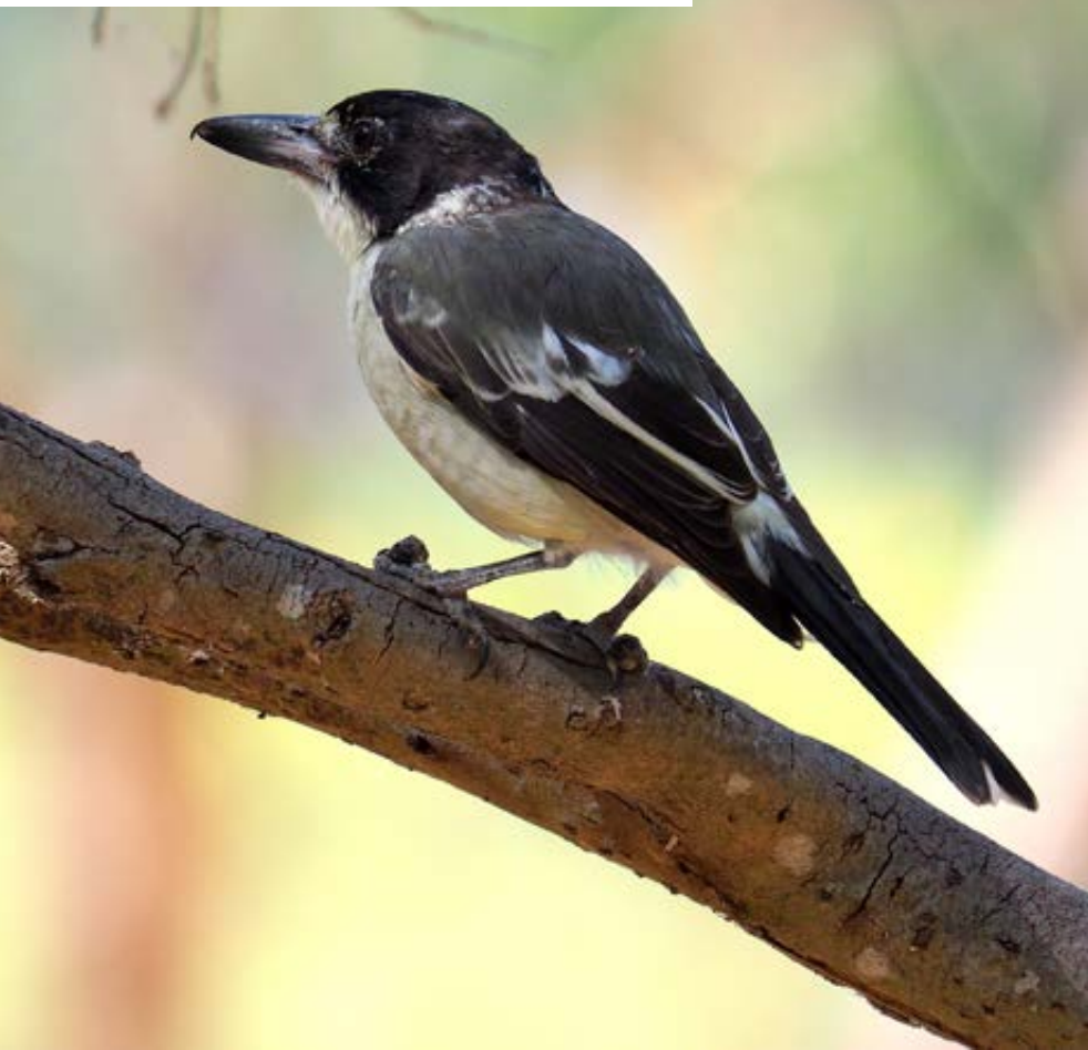
Cracticus torquatus Grey Butcherbird