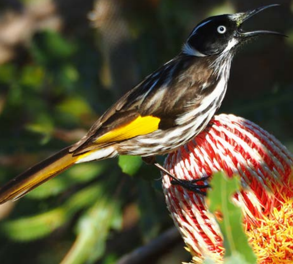
Phylidonyris novaehollandiae New Holland Honeyeater