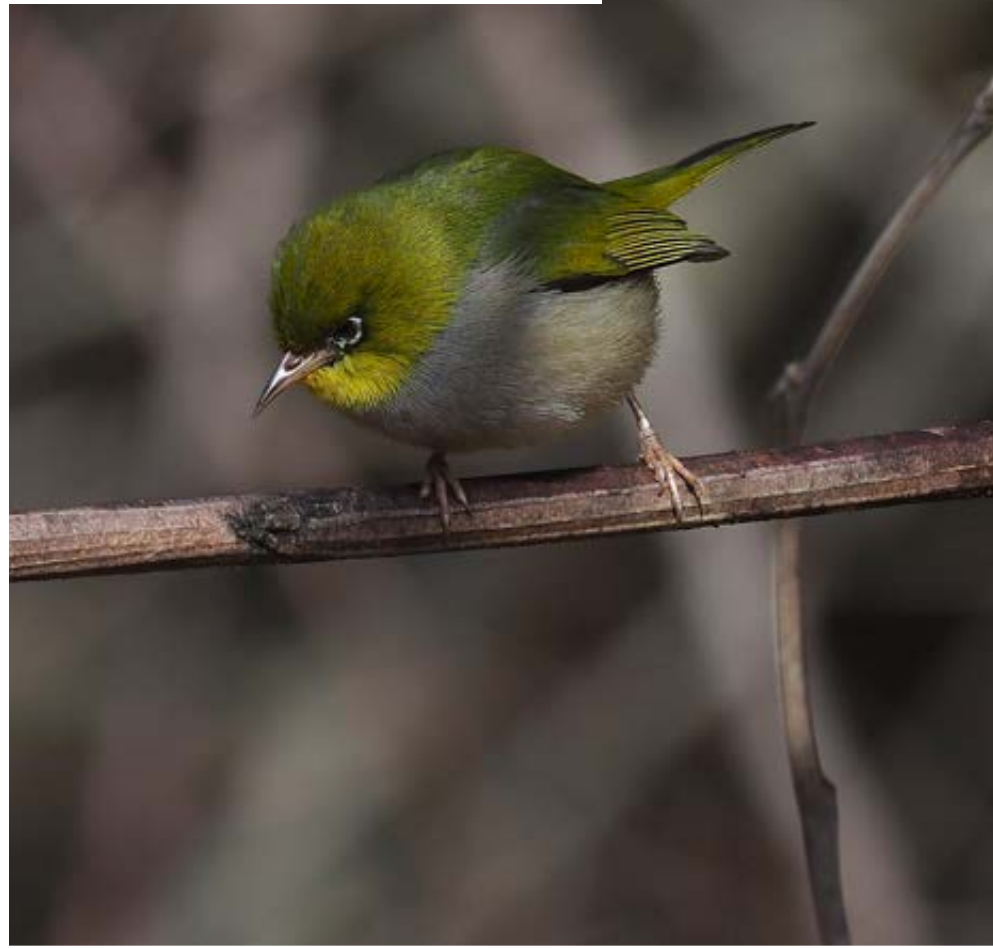
Zosterops lateralis Silvereye