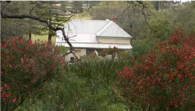
Rear view of Allen Park cottage with Templetonia retusa flowering in the foreground

It has been established that our group will not have to find a big pot of money to contribute to this project, but will be able to provide in-kind support in as many ways as possible. A target to raise funds will be set and donations will be welcomed. Below are images of the cottage that we propose to name "Pleasant Valley Cottage".