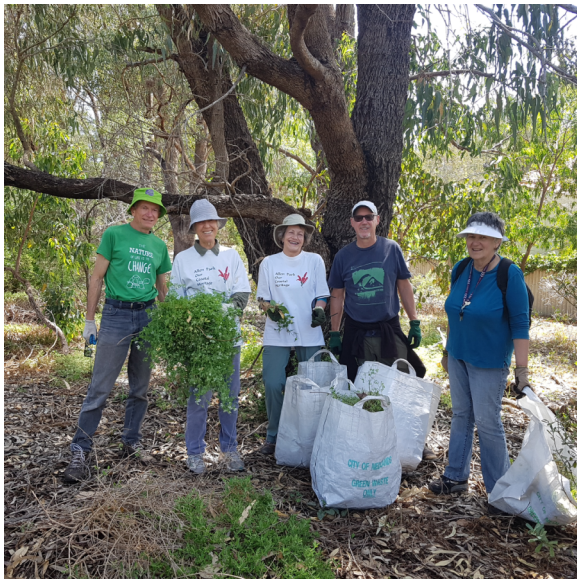
Volunteers and their stash of weeds

As the year draws rapidly to a close, there's little time to read correspondence but this newsletter conveys important information and invites feedback from you, so please read on. It also reminds us of the Spring that hadn't really sprung. There was a short period of yellow wattles and pink fairy orchids flowering abundantly, and then the summer pattern began in haste. Now having just experienced a record run of 40-degree temperatures for December gives all the more reason to