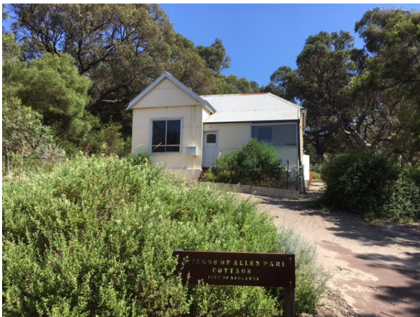
Looking north towards the Allen Park cottage