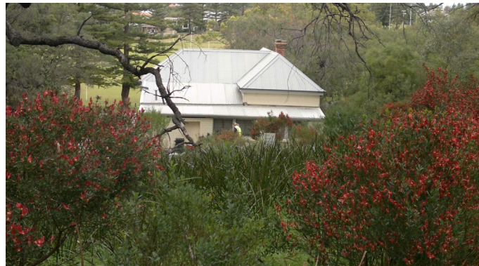
Rear view of Allen Park cottage with Templetonia retusa (Cockies tongue) flowering in the foreground

We need your help to ensure that the cottage is upgraded. The cottage locally known as the "Allen Park Cottage" is a wonderful community asset and in need of repairs: needing to be restumped, asbestos needs to be removed and modest modifications to bring the building up to scratch. With the Mayo cottage having burnt down in 2009, this cottage is the last original building left in the Heritage Precinct and it has been established that it is almost 100 years old. Sited in the Heritage Precinct are Tom Collins House, Mattie Furphy cottage, and Fricker cottage, which were moved into the precinct during the past 20 years. The need for repair was raised in March 2016 when a structural report was