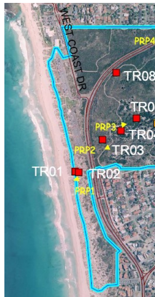
Bush Forever Area 308 (blue line)

Join our group and help to protect the beautiful natural environment at Trigg Beach forever..