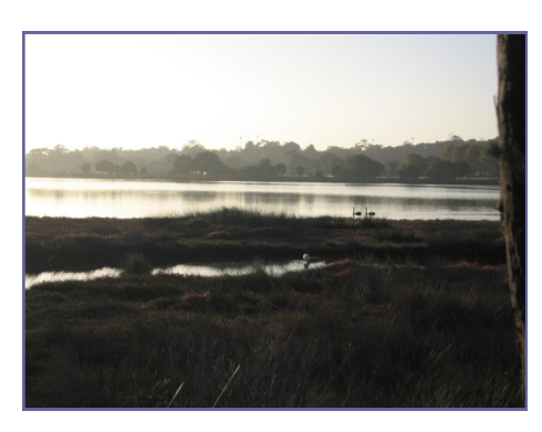
Twilight at Alfred Cove

Promotion of the Estuary's environmental values through publiceducation strategies will also be an important function.